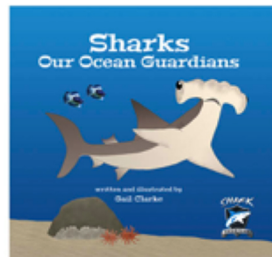
Sharks, Our Ocean Guardians Commissioned by Shark Guardian UK

When Cosmos the baby humpback whale learns about the creatures that live in the world, he wants to see some of them for himself. He sets off on an adventure to find polar bears and penguins. His whale friends try to warn him that he is making a big mistake but Cosmos is so excited about his plans that he won't stop to listen. Follow the brave baby whale as he meets a huge turtle, swims into the arms of a giant squid, watches penguins at play and rescues a baby polar bear from being swept out to sea.