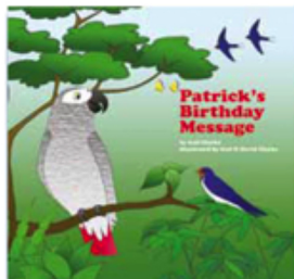
Patrick's Birthday Message

Patrick is an African grey parrot who lives in the jungle in central Africa. His Great-Grandpa Gilbert will soon be one hundred years old and Patrick wants to send him birthday greeting. There is just one big problem - Great-Grandpa Gilbert lives thousands of miles away in Australia. Follow the birthday message as it travels with the help of Patrick's animal friends both large and small, and learn fun facts about migration along the way.