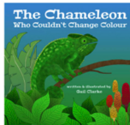
The Chameleon Who Couldn't Change Colour

A non-fiction/fiction blend about sharks, their importance in our oceans and the role they play in keeping the planet healthy. This book looks at the development from prehistoric sharks to those we know today, the structure of sharks, some of the different species, the ocean food chain and the importance of sharks as apex predators. It also introduces Jed the hammerhead. Future books in this series will follow Jed as he explores the world's oceans.