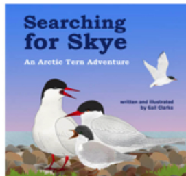
Searching for Skye An Arctic Tern Adventure

Patrick is an African grey parrot who lives in the jungle in central Africa. His Great-Grandpa Gilbert will soon be one hundred years old and Patrick wants to send him birthday greeting. There is just one big problem - Great-Grandpa Gilbert lives thousands of miles away in Australia. Follow the birthday message as it travels with the help of Patrick's animal friends both large and small, and learn fun facts about migration along the way.